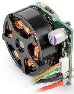
The new ECX FLAT 32 with integrated electronics.