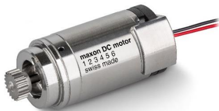
The aluminum attenuator, powered by brushed DC motors.