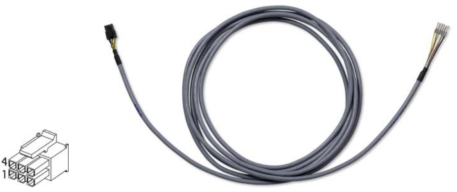
Figure 3-4 Hall Sensor Cable