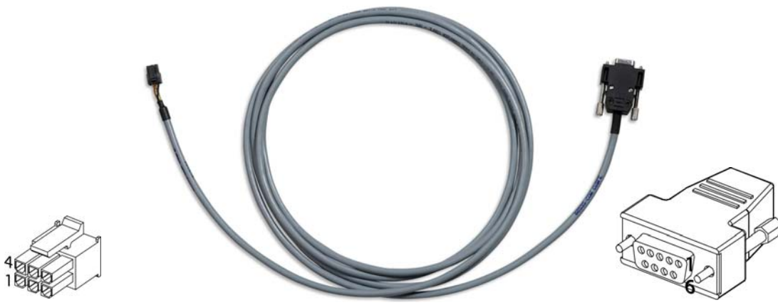
Figure 3-9 RS232-COM Cable