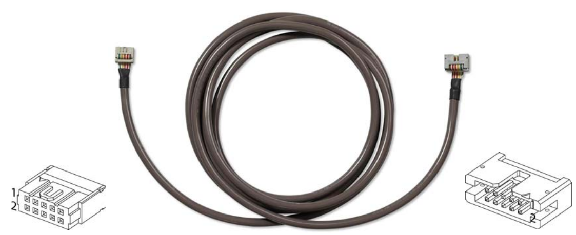
Figure 3-5 Encoder Cable