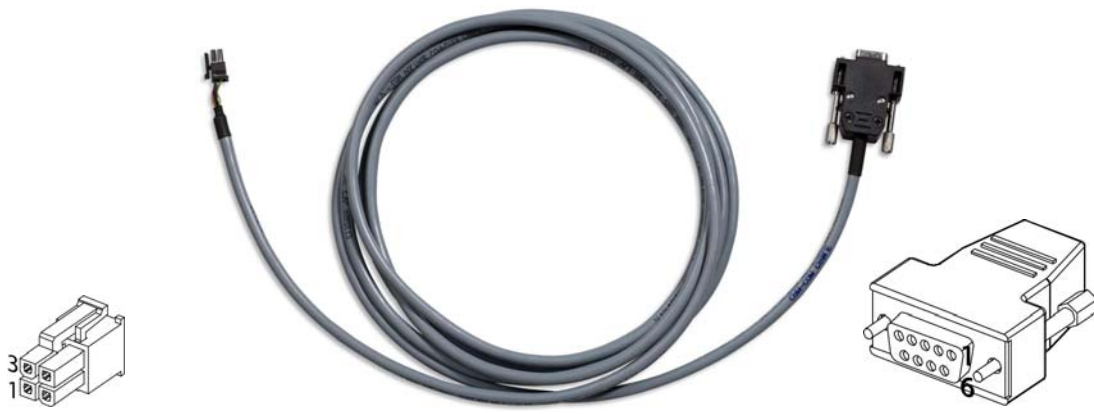
Figure 3-11 CAN-COM Cable