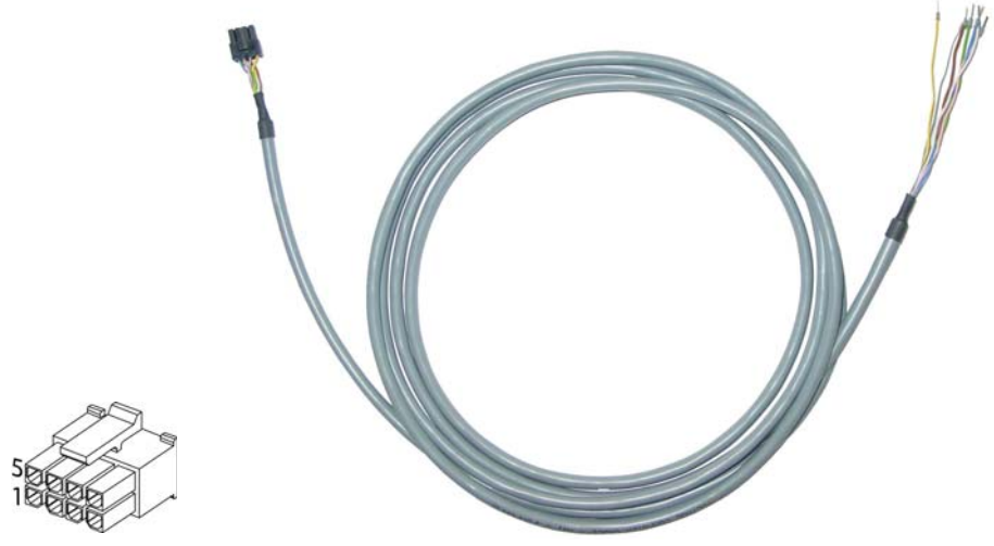
Figure 3-8 Signal Cable 4x2core