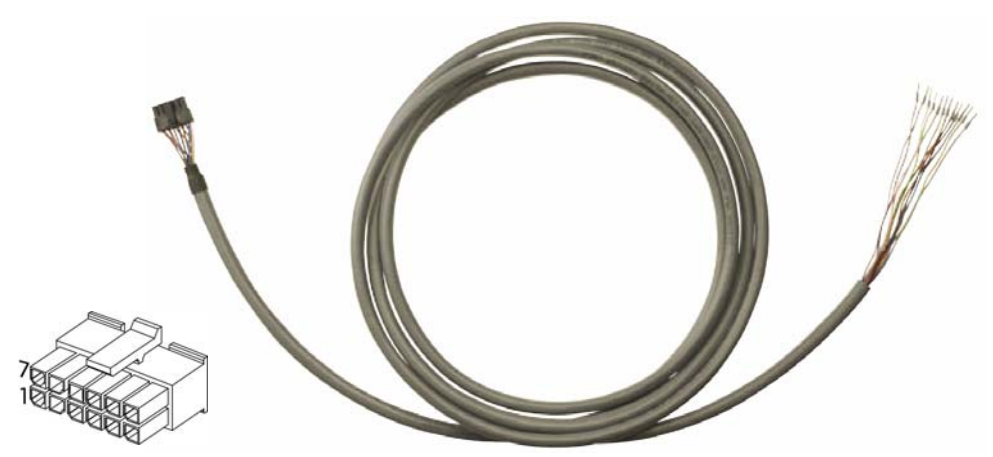
Figure 3-7 Signal Cable 6x2core