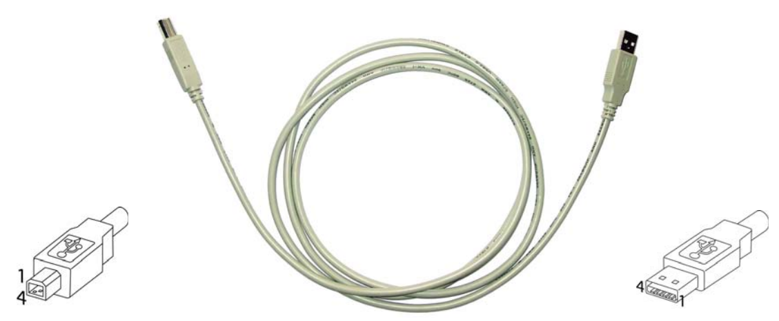
Figure 3-10 USB Type A - B Cable