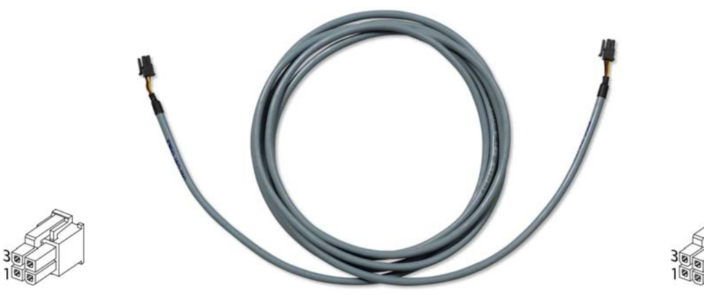
Figure 3-12 CAN-CAN Cable