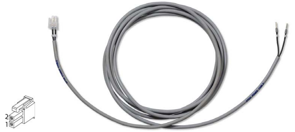
Figure 3-2 Power Cable