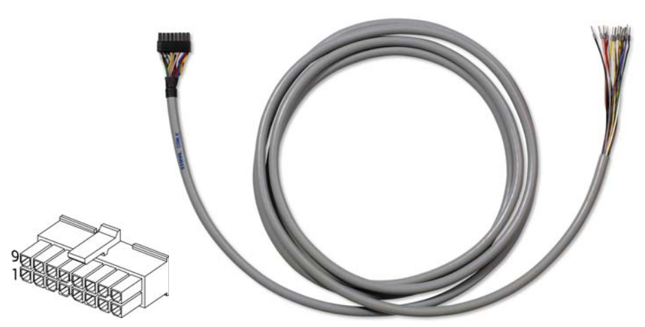
Figure 3-6 Signal Cable 16core