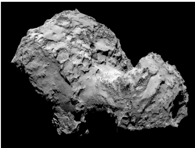
This is what comet 67P looks like. Recorded by the Rosetta space probe shortly before arrival.