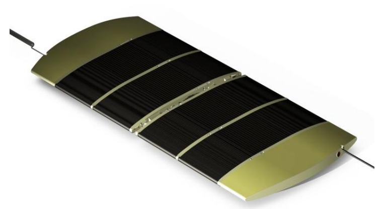
Fig. 2: This 3D CAD drawings illustrate what the PowerNurse looks like and it's general operation. Notice how thin the final product was required to be in order to slip comfortably under a patient. © 2012 Astir Technologies

Chris McNulty's solution involves a series of conveyor belts, motors, and electronics that fit into a thin profile that allows the transfer of very heavy weights automatically. During development of his first prototype, over 400 pounds was easily transferred using 1/5th of the capacity of the 250 Watt Maxon EC45 motors designed into the device. This meant that the 120 Watt ECmax 40 motors could be used in the PowerNurse, while the larger EC45 motors could be used for a bariatric model in development.