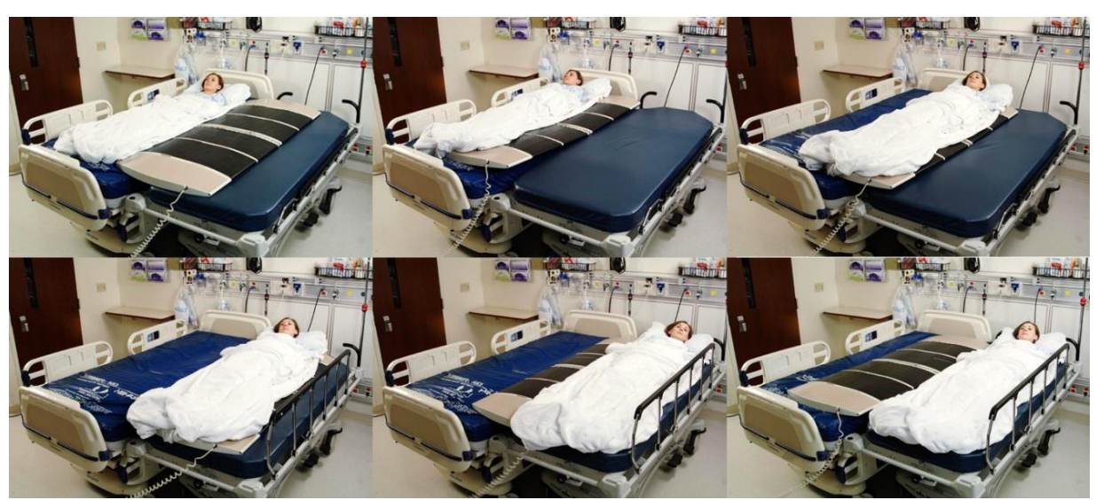
Fig. 4: These six photos show how the PowerNurse transfers a patient from one hospital bed to another by simultaneously crawling under the patient while at the same time moving the patient on top of the device.